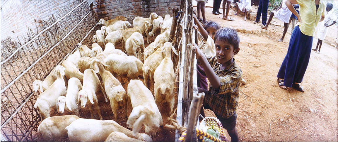
After the slaves' release, the government distributed restitution payments of sheep to each of those granted official release certificates. Two of Chinnan's grandchildren stand beside a sheep pen filled with livestock intended to economically assist the family as they return to society.