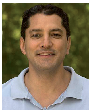
Juan G. Santiago

An open challenge in the field is the problem of robust and efficient sample preparation and its integration with other on-chip steps such as reaction, separation, and detection. Price et al. ( Lab Chip , 2009, 9 , DOI:10.1039/b907652m) review the historical development of strategies to purify nucleic acids and the research trends in miniaturizing DNA purification using solid phase extraction. The problem of on-chip chemical processing is