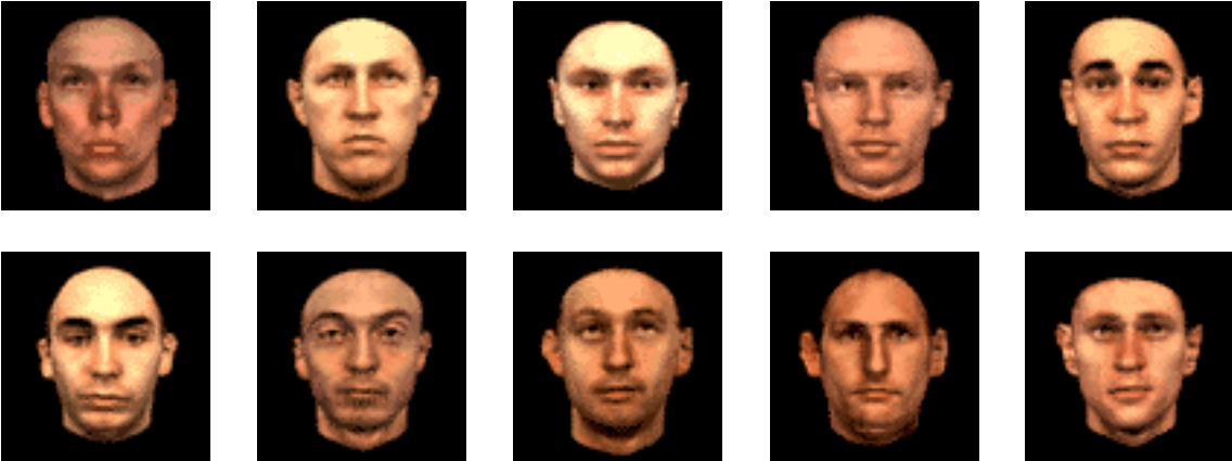
figure 2. A subset of the face stimuli used in our study.