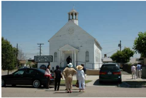
The group arriving at the old church

The building of the original Reedley Presbyterian Korean church remains intact but is now used by a Latino Pentecostal church. A small group of Koreans worship there once a week, led by Elder Bach.