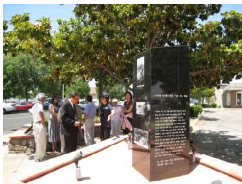
The group at the March 1 movement memorial in Dinuba