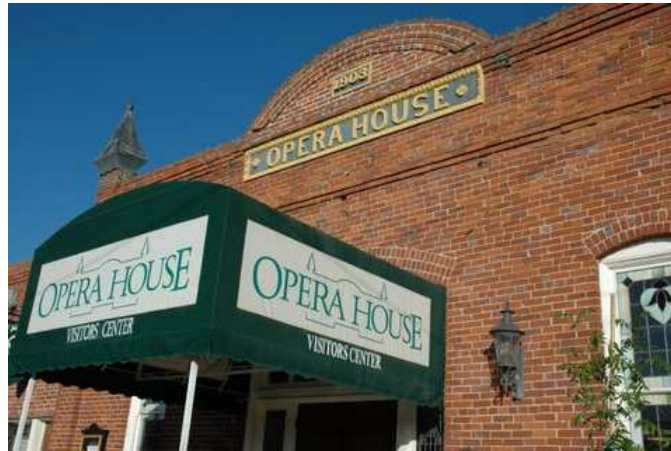
Newly renovated Opera House of Reedley